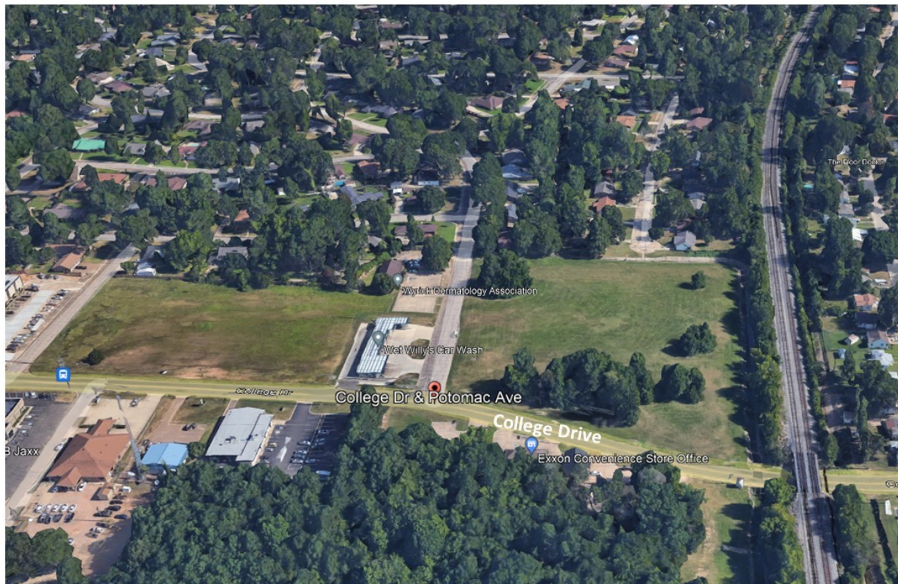
View of SW corner of College Drive and Potomac Ave property.